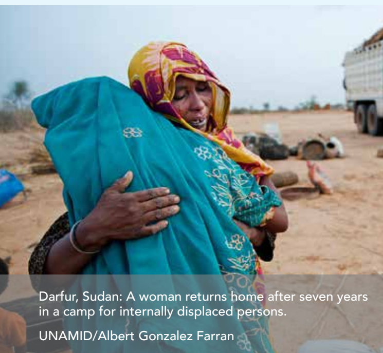
Darfur, Sudan: A woman returns home after seven years in a camp for internally displaced persons.