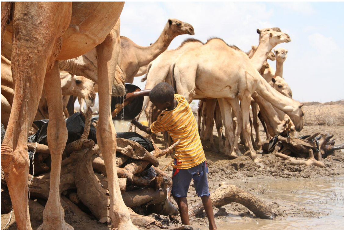
Kenyan boy fetches water as camels drink from near-dry water pan in drought-stricken village of Bandarero, Moyale sub-county.

The EA HPPP supports systematic long-term private sector, UN, NGO, Government and community partnerships to address the impacts of natural disasters, emergencies due to conflict and complex urban and out-of camp displacement situations.