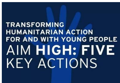
Compact for Young People in Humanitarian Action