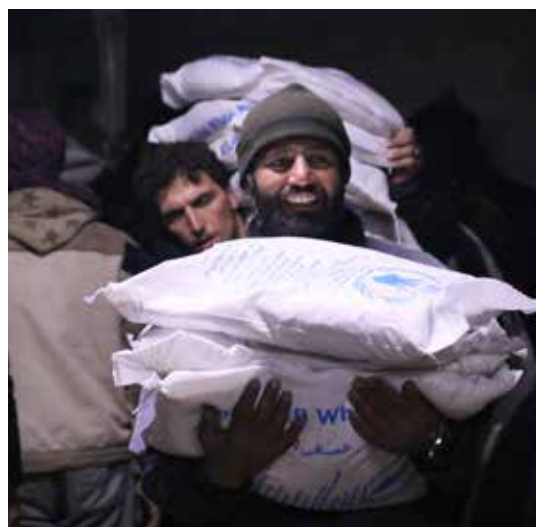
A Syrian man offloads humanitarian food aid from a truck.

principles of humanity, neutrality, impartiality and independence in response strategies. For example, Trócaire established a humanitarian learning platform to provide its staff with accessible training modules on humanitarian principles and action. Member States also took action, such as Norway's decision to include language on humanitarian principles in grant agreements. The European Union supported research and dialogue between States on the scope for strengthened, principled humanitarian action. Ukraine established clear, simple and accelerated procedures for rapid and unimpeded delivery of humanitarian aid, including to areas under the control of armed groups.