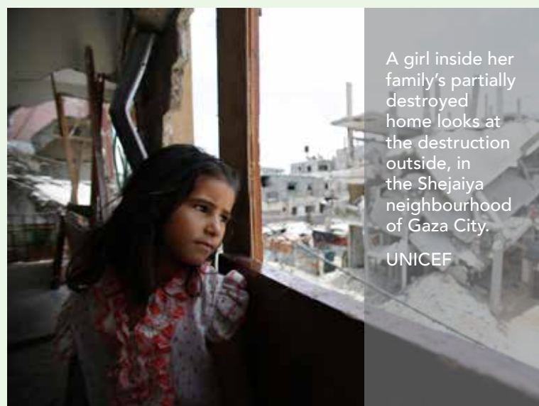
A girl inside her family's partially destroyed home looks at the destruction outside, in the Shejaiya neighbourhood of Gaza City.