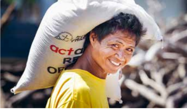
▲ NGOs could also use the social system on the Philippines. With cash transfers people could buy rice.

Aid organizations save time and resources if they can use pre-existing social safety nets in case of catastrophes – building a distribution system is costly and time consuming. The flip-side is that households that are not part of the social protection program may become disadvantaged. Governments and aid agencies must work together closely to ensure that only disaster-affected people within an existing social protection program receive emergency aid and also make sure to reach disaster-affected people who are not part of existing programs. Humanitarian agencies need to take into consideration that social protection programs may at least be partially driven by political incentives due to the central role of national governments in program design – for example to secure votes. They should respond accordingly to ensure that all emergency response efforts are truly needs-driven.