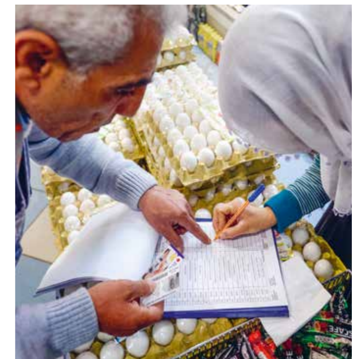
▲ Checking ID cards protects from abuse

Also “mystery shoppers” – members of the partner organizations who pretend to be beneficiaries – test whether the traders violate the agreements made with them. For example, if a trader complies with a shopper’s request to buy cigarettes instead of bread, he or she is excluded from the programme.