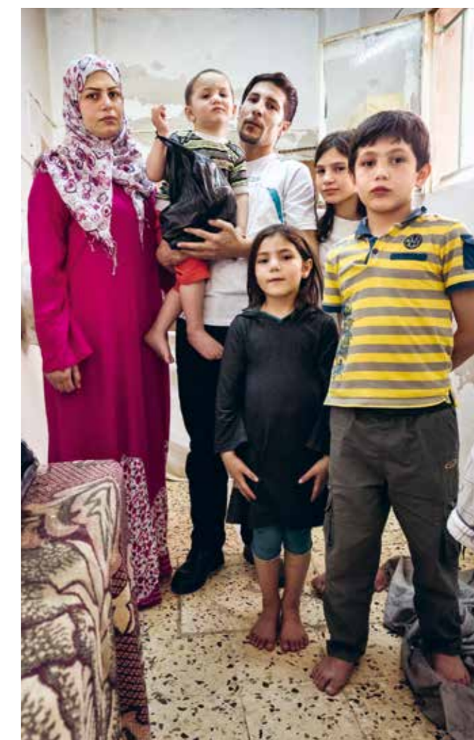
▲ Cash transfers strengthen families' resilience.

investments in emergencies depends crucially on the amount of cash that is given, when it is given and the wider constraints people face. Typically in emergency relief scenarios, money is most likely to be spent on immediate basic needs, such as food. ODI notes, however, that when situations are less acute or when more generous cash transfers are provided, cash can help stimulate productive investment, such as buying livestock or setting up small shops. In addition, while some aid recipients may use grants solely to cover urgent needs, others may be able to invest in income-generating activity, moving along the path of self-recovery. While additional support and services are required, ODI notes that cash grants can help people to re-establish successful livelihoods. Cash transfers also make beneficiaries active participants in their own recovery, helping them to build the skills and assets needed for future resilience.