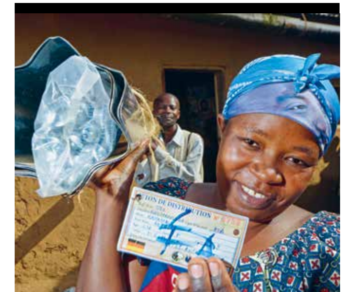
▲ CTP also allows for vouchers for construction material.

Cash transfers, however, need to be sufficient in size to cover basic needs. For example, in the West Bank and Gaza, an ODI study in 2012 found that beneficiaries felt cash transfers were too small to cover basic household needs, especially in large families, and that they couldn't cope without additional forms of assistance. To address this issue, a growing trend