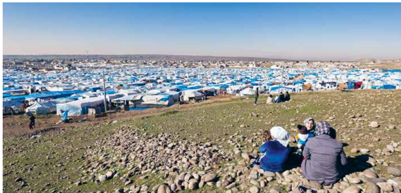
▲ CTP-planning is based on the needs of people suffering from hardship.

This breaks the long tradition of governments and organizations deciding what people need – and assuming that affected populations cannot be trusted to make sensible decisions themselves. In addition, cash can run counter to domestic policy considerations or preferences by agencies to use stockpiles of in-kind goods, not to mention long-standing policies and traditions about how to provide in-kind assistance.