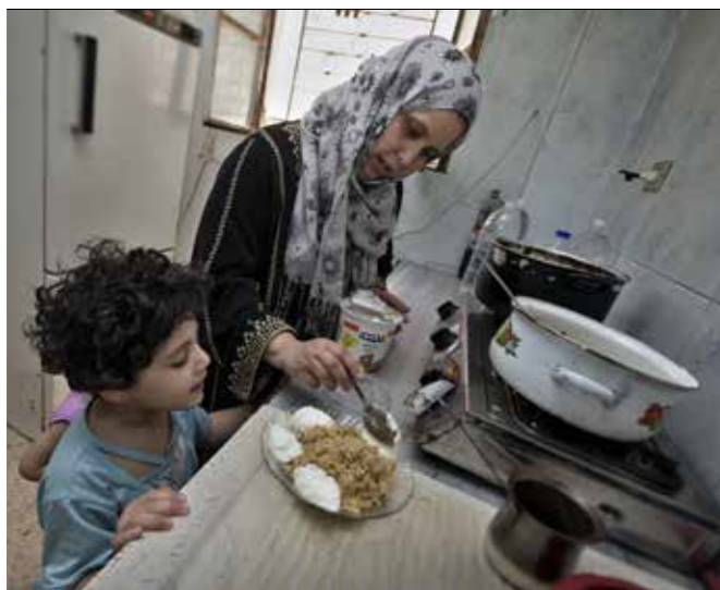
▲ Cash transfers allow beneficiaries to make their own dietary choices

How does an aid agency assess what the most appropriate humanitarian intervention is in case of an earthquake in country X or drought in country Y? Here decision trees, such as those developed by ECHO or DFID can help. Key aspects NGOs need to consider when making their evaluations include, among others: are markets available? What is the security situation on the ground? Are cash payments possible? What are beneficiary preferences? And can these needs be met in the form of relief supplies? The first questions to ask relate to the emergency situation. Agencies must identify the needs of the affected population and ascertain if they can in fact be met through specific commodities and/or services, such as education and health services. At times, alternative interventions, such as advocacy campaigns, are needed instead. In addition, in select cases a government may not allow cash transfers, so the legal framework will come into play. If needs can be met by resource transfers, and cash transfers prove to be culturally and politically acceptable in the local context, program context and objectives need to be taken into consideration. For community services such as health or a clean water supply, technical interventions will