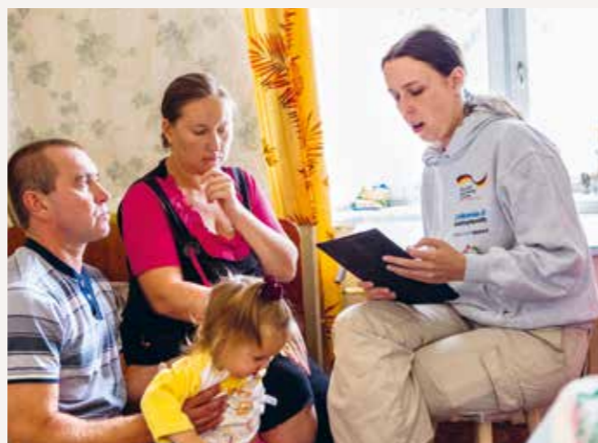
▲ What is it you need most? – this is the question employees of Diakonie Katastrophenhilfe ask all families in need.

← It may happen that the aid organization does not supply what is needed and that it does not use funds efficiently. Anyone who does not think about how to help in the best way easily falls into activism. Such assistance is oriented not to demand but to supply – and they cart what they have into the emergency area. But that is not necessarily what people on the ground need. If the need is calculated wrongly, conventional aid can also ruin the local market, e.g. the business of small traders selling lentils – who can't sell them anymore, because the aid organization delivers lorries full of food. And cash transfers do not work if there is no market or the person has to walk five kilometres to the next shop. In short: without a profound analysis of needs, an organization can neither define its goals and make plans, nor measure at the end what it has achieved. And yet Diakonie Katastrophenhilfe has an obligation to account for its actions to both its donors and the aid recipients. A genuine needs analysis protects it from abuse as well: superfluous goods in an aid package tend to be sold to third parties. It is also very important that the aid organization treats all groups needing help in the disaster area in the same way – not on the motto: this refugee gets something, the host or the host village does not. That only causes envy and conflicts.