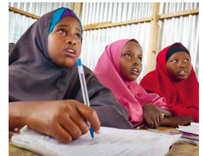
▲ CTP also allows for vouchers for education.

Finally, agencies must decide if grants will be unrestricted multi-purpose cash transfers, aimed at covering a household's basic needs whether partially or fully, or sector-specific, targeted to cover a specific need such as shelter or education. In each situation, agencies will need to determine the best CTP modality, delivery agent and delivery method to use based on a context-specific analysis of the options available in each crisis.